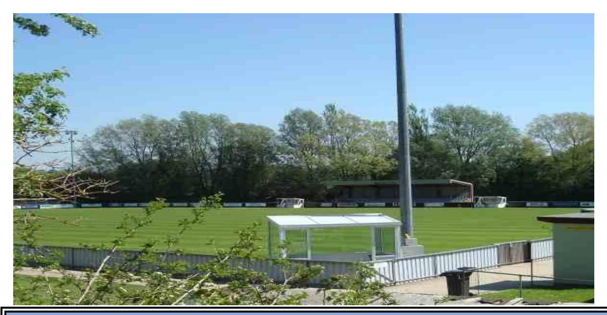
Driving to the Ground